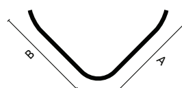
Stainless steel and Brass Section

ROUNDCORNER can perfectly cover over chipped tiled corners and are supplied with self-adhesive glue strips with excellent hold which help absorb shock impact.