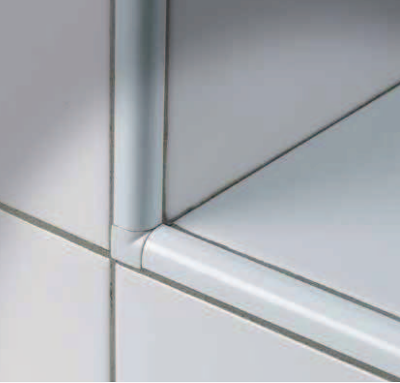
Wall section where the application of the jointing RJ capsule for the profile trim finish is evident.

Other applications may be: top skirting finish (as seen in diagram) or edging of tile covering, natural stone or limestone as well as for moquette carpeting. To ensure a perfect grip, the profile trim must be completely filled all within the cavity with the grout for layers.